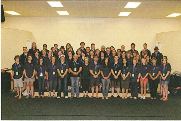
Southern Cross Kids' Camps Dunedin Team 2010